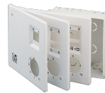
KIT SCB (TRASF.E.C.)