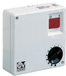
C 1.5 (COMANDO EL. 1.5 A)